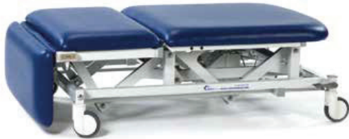
Low patient transfer height